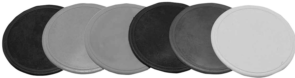
Spectrum™ Poly Spots W4828 and W8869

Distance from the start to finish line should be about 100 feet. Set up a starting line. Each team lines up single file behind start facing the finish line at the opposite side of playing area. Have each team place their poly spot on the starting line and the other poly spot on the finish line. Place rubber pig on starting line and have the teams kneel down behind the pig. Have players then place their hands on the floor (now on hands and knees). Game starts with the word “go.” The front player will pick up the pig and pass it over his or her head to the player behind. That second player will pass the pig through the legs to player behind him/her. Continue alternating until pig gets to the last player. When last player in line receives the pig, s/he will stand up and run the pig to the front of the line and take the front position. S/he will get on hands and knees, pass the pig over head and start the chain again. This will move the team forward until they eventually reach the finish line. Note: no other player should be moving other than the player with the pig coming to the front of the line. If an entire team moves forward with all players walking on their knees, they are disqualified.