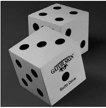
Gator Skin® Foam Dice W6801