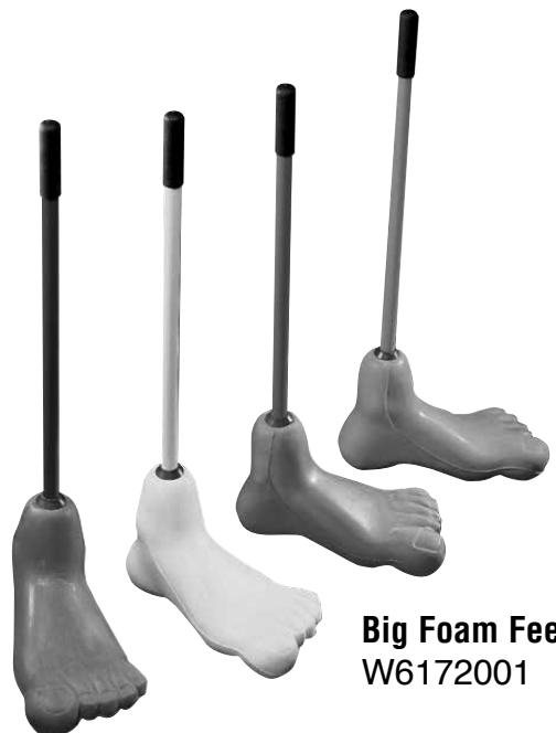
Big Foam Feet W6172001