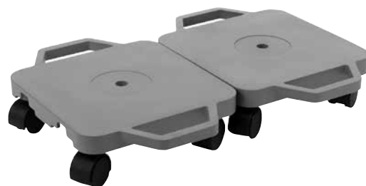
Spectrum™ Connect-a-Scooter 12” Scooters 16” Scooters W7626 set of 6. W7986 set of 6.

Give each team six Big Foam Feet and six Spectrum™ Connect-a-Scooters. Have each team link their scooters together, sit on them cross-legged (with no shoes) and hold the Big Foam Feet in “rowing” position on alternating sides. These are the “centipedes!” Set up rectangular racing area – about 90 feet long – with boundary lines at each end. Place four empty hoops along one boundary line. Set up four hoops (each containing four fleece balls) across from them along the far boundary line. The “centipedes” should line up next to an empty hoop, which are their “nests.” The fleece balls are the centipedes’ food supply, which they must gather one at a time and bring back to their nests for winter. They must do this quickly, however, before the first frost. It’s a good thing centipedes have so many feet to help them move! When the instructor signals go, each centipede team must propel themselves forward using only their Big Foam Feet, travel to pick up a ball and bring it back to their nest. Then they must turn around and travel to pick up another ball. If centipedes use their hands or “real” feet or pick up more than one ball at a time, they must go back to start. The first centipede teams to successfully gather the entire food supply into their nest wins the game!