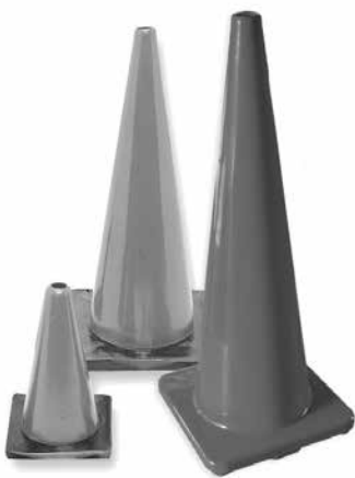
Orange Bottom-Weighted Cones W5047007