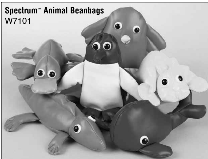
Spectrum™ Animal Beanbags W7101

Player holds the ball with 2 hands in front of his/her face. Place beanbag on top of the ball, and then drop the ball with the bag on top. When ball hits the ground, the beanbag will bounce off the ball into the air. Have 6 players each hold a bucket and catch the corresponding beanbag according to color. Write the habitat of each animal on buckets and change the game so players catch each animal according to its bucket.