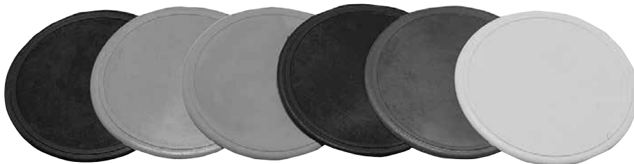
Spectrum™ Poly Spots W4828 and W8869

This game is played much like Frisbee® football. There will be two to four players on each team; make sure both teams have an equal amount of players. The spots are to be placed in a large rectangular shape with like-color spots about 15 feet apart and the opposing color about 30 feet apart. One team is to be called red and the other blue. The red team will start between the blue spots and the blue team between the red. Object of the game is for the blue or red team to get the pig past the like-colored poly spots by a sequence of passing the pig to teammates. Player who has the pig needs to stay in place and pass it to a teammate. Players of opposing team will try to prevent team from scoring by knocking pass of pig down or by catching pig. Once pig hits floor other team immediately starts their turn to try to score. Game is won once one team scores seven times.