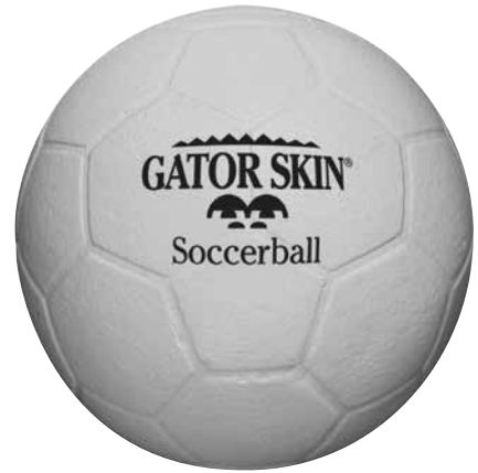
Gator Skin® Soccer Ball W9801

Each team should form half a large circle with approximately two to three feet between each player. Begin play with one ball. The object of the game is for players to “kick” the ball past the other team. Players must use the Big Foam Feet for kicking instead of their own! No hand or foot contact with the ball is allowed, and kicks must be below shoulder level. Players can use the Big Foam Foot to try and trap the ball before kicking it back. A team scores a point for every one of their kicks that makes it past their opponents. Once kids become accustomed to using the Big Foam Feet to maneuver the ball, try adding a second ball for an extra challenge! Continue play for a designated time period or until a certain number of points have been reached.